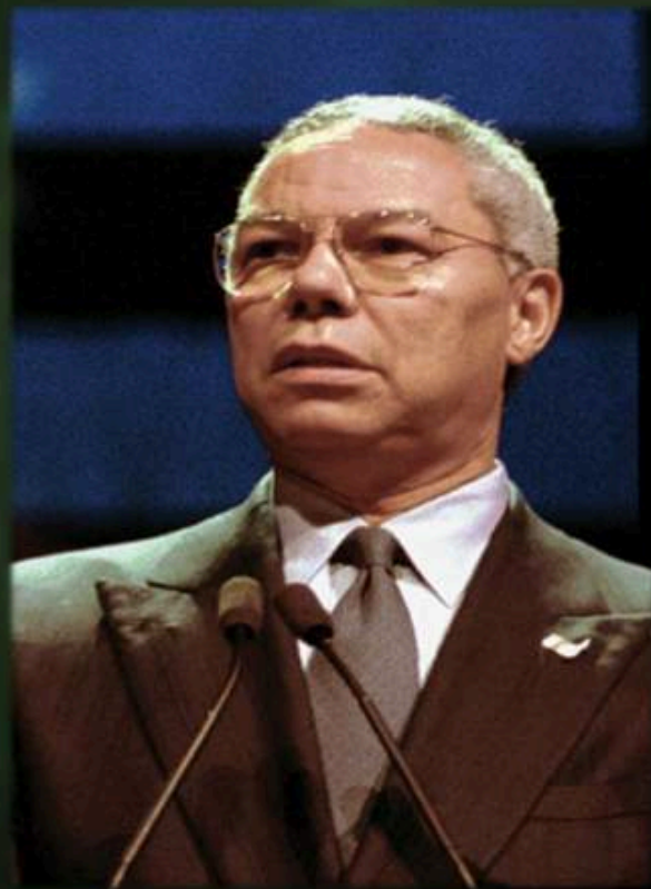
General Colin Powell

The day soldiers stop bringing you their problems, is the day they have either lost confidence that you can help or concluded you do not care. ”